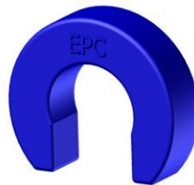
Figure 2 TECTITE Removal Tool